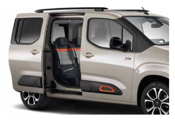
Twin sliding side doors - Standard across the range