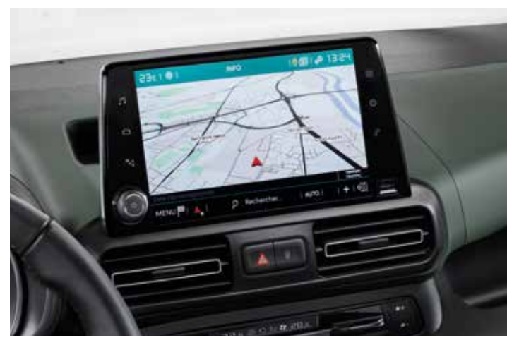
8" Touchscreen with Android Auto/Apple Carplay™ - Standard across the range