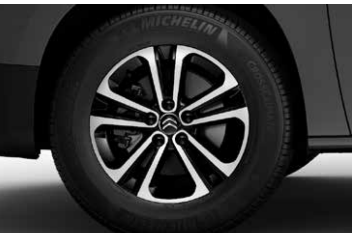
16" 'Starlit' Alloy Wheels - Standard on Feel versions