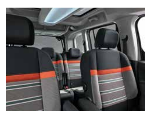
RESADA GREEN Part of the optional XTR Pack