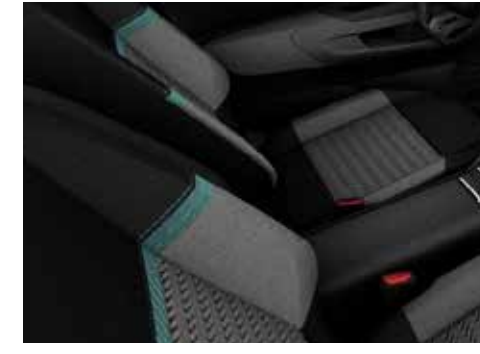
METROPOLITAN GREY Standard on Feel