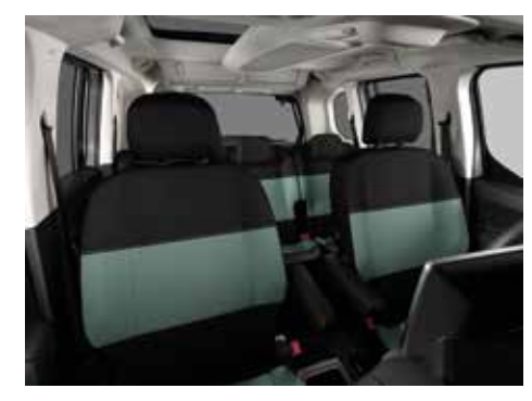
GREEN MICA CLOTH Standard on Touch