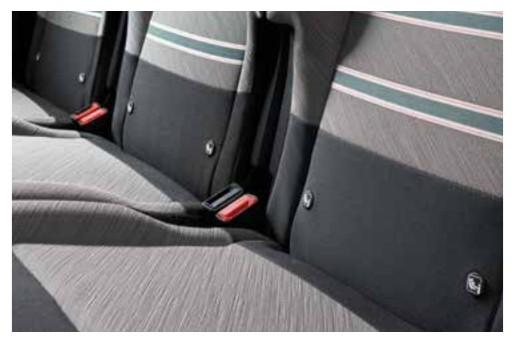
x3 ISOFIX mounts - Standard across the range

We know how important it is to present the right facts and figures, so our brochures are regularly updated, however it is important that you consult your dealer when ordering your vehicle to ensure you are advised of the latest specifications and equipment.