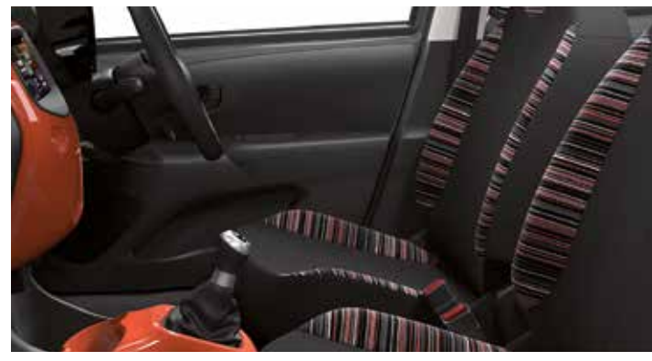
SUNRISE RED 'ZEBRA' CLOTH Standard on Feel versions