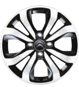
15 INCH 'PLANET' ALLOY WHEELS Optional on Feel versions