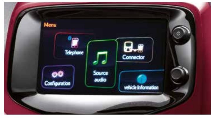
7 inch touchscreen – Standard on Feel