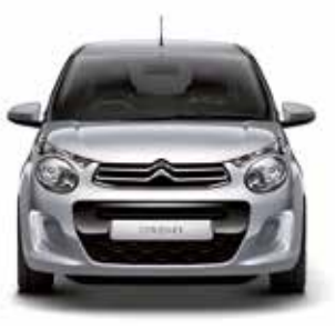
Gallium Grey (M)