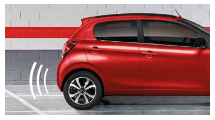
Rear parking sensors - Standard on Feel

We know how important it is to present the right facts and figures, so our brochures are regularly updated, however it is important that you consult your dealer when ordering your vehicle to ensure you are advised of the latest specifications and equipment.