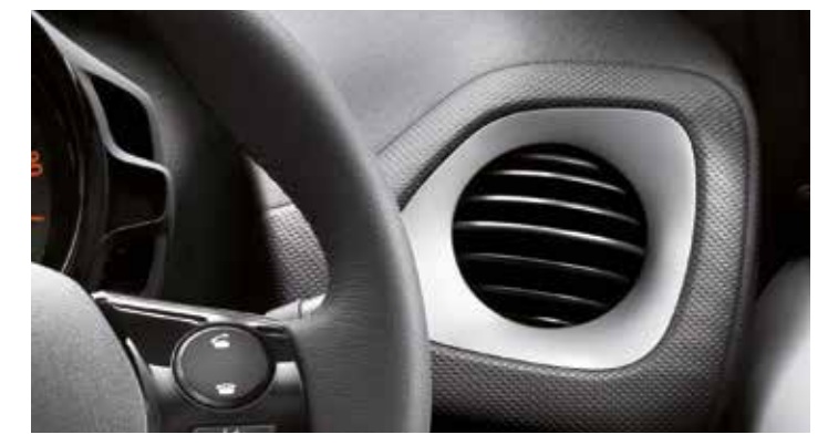
Air conditioning – Standard on Feel