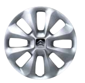
15 INCH 'COMET' WHEEL COVERS Standard on Feel versions