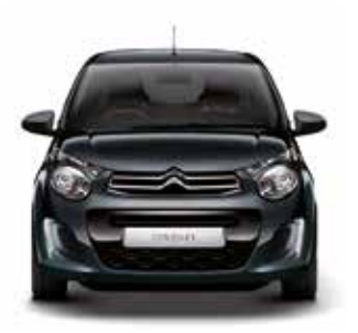
Carlinite Grey (M)