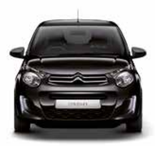
Caldera Black (M)