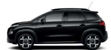
Ink Black (Metallic)