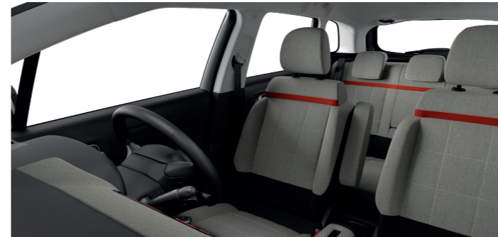
METROPOLITAN GREY AMBIANCE Optional on Feel & Flair