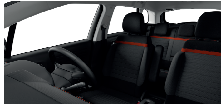
URBAN RED AMBIANCE Standard on Flair, optional on Feel