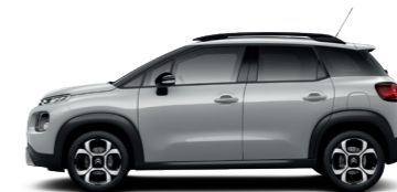
Cosmic Silver (Metallic)