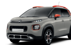
Orange No cost option on Flair, optional on Feel