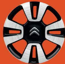
16 INCH 'MATRIX' ALLOY WHEELS Standard on Feel