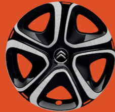
16 INCH 'STEEL & STYLE' WHEELS WITH 3D WHEEL COVERS Standard on Touch