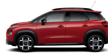
Passion Red (Flat)