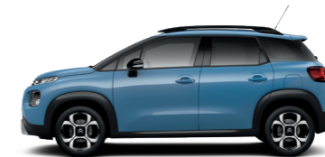
Breathing Blue (Metallic)