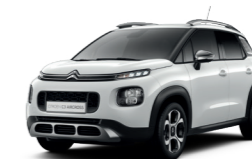
Silver No cost option on Flair, optional on Feel