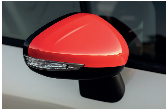
Orange painted door mirrors – Part of the Orange Colour Pack.