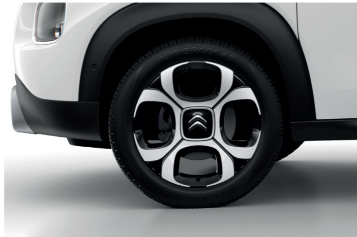
17 inch diamond cut '4 Ever' alloy wheels – Standard on Flair, optional on Feel.