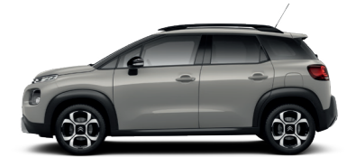
Soft Sand (Metallic)