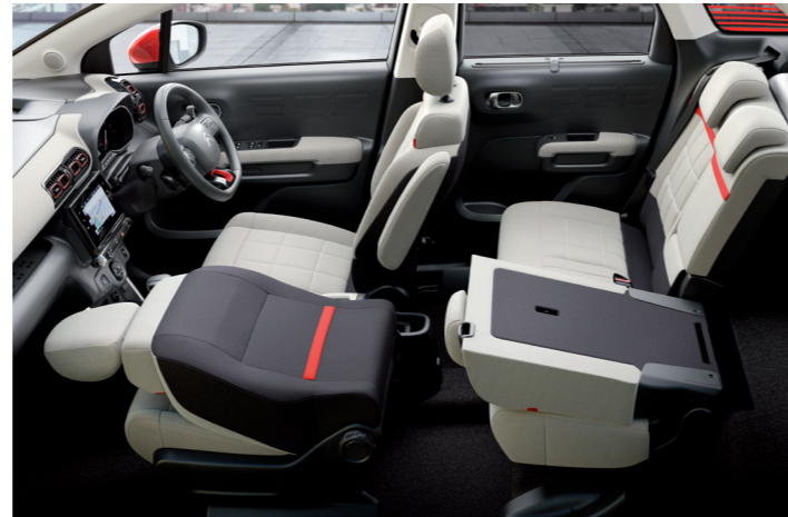
Folding front passenger seat – Standard on Feel & Flair.