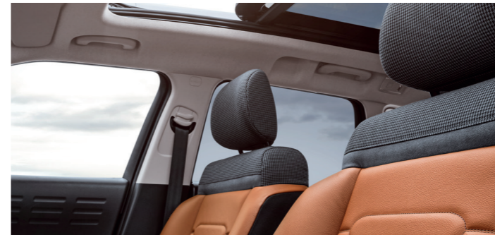
HYPE COLORADO AMBIANCE (with heated seats) Optional on Feel & Flair