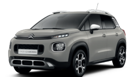
White No cost option on Flair, optional on Feel