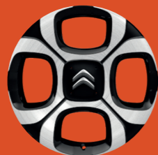
17 INCH '4 EVER' ALLOY WHEELS Standard on Flair, optional on Feel 2