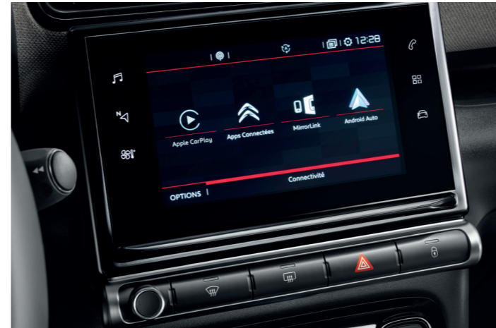
7 inch touchscreen – Standard on Feel & Flair.