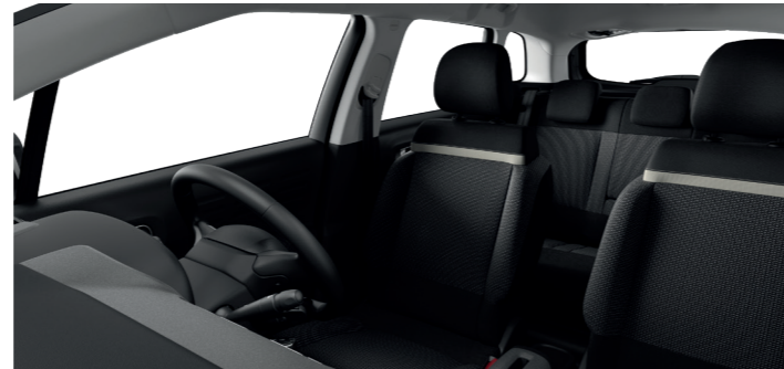
GREY 'MICA' CLOTH Standard on Touch & Feel