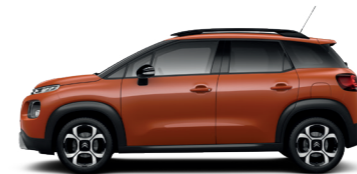
Spicy Orange (Metallic)