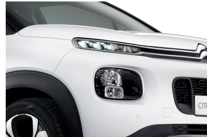
Halogen headlights with LED Daytime Running Lights – Standard on Feel & Flair.