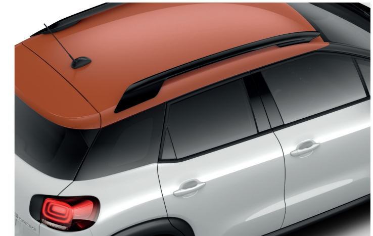
Spicy Orange bi-tone roof – No cost option on Flair, optional on Feel.