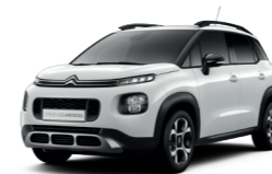
Black Standard on Touch & Feel