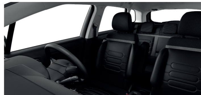
HYPE MISTRAL AMBIANCE (with heated seats) Optional on Feel & Flair