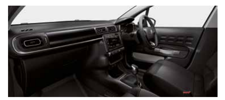
GREY 'MICA' CLOTH Standard on Touch, Feel and Flair

Please note: Colours and pictures shown are for illustration purposes only. Please consult your Dealer for definitive colour and trim/upholstery details.