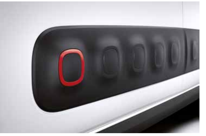
Airbump® coloured surround6 - Standard on Feel & Flair