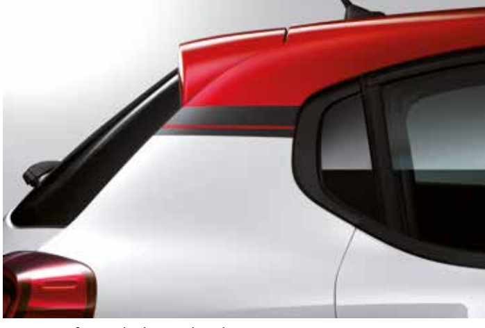
Bi-tone Roof - Standard on Feel & Flair