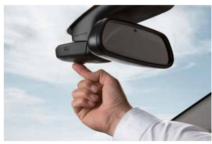
ConnectedCAM Citroën ^{T\!M} - With dash cam functions - Standard on Flair, Optional on Feel