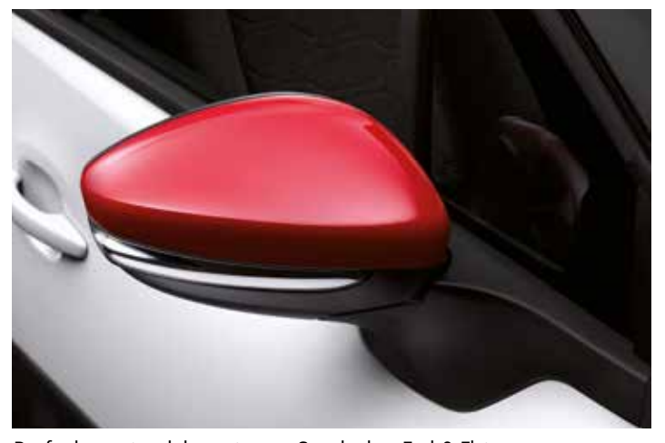
Roof colour painted door mirrors4 - Standard on Feel & Flair