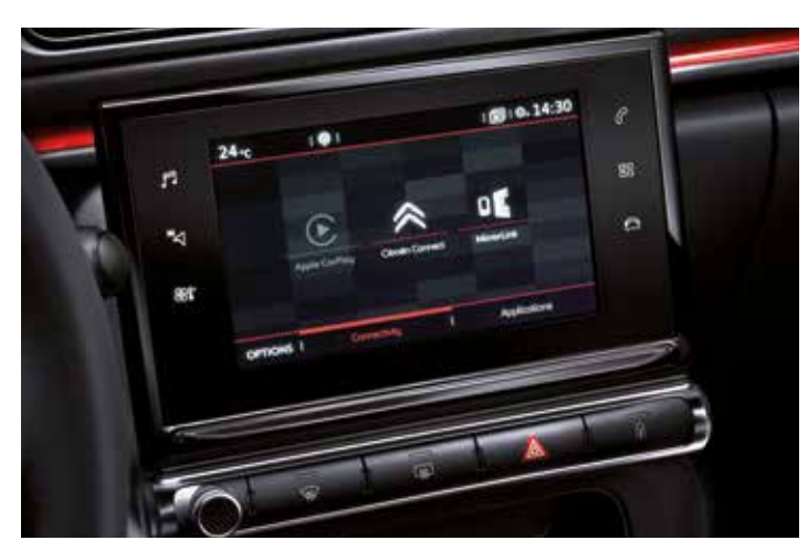
7 inch touchscreen - standard on Feel & Flair