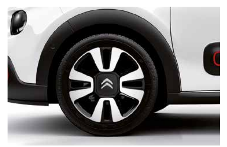
16 inch 'Matrix' alloy wheels - Standard on Feel