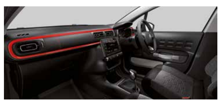
'URBAN' RED AMBIANCE (Brings leather stitched steering wheel) Optional on Feel and Flair