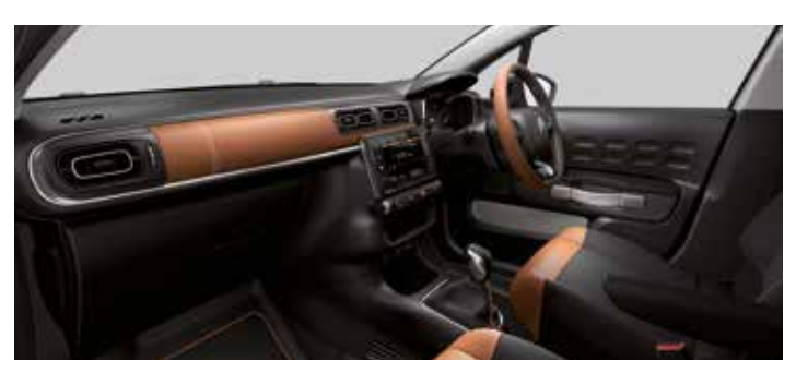
'HYPE' COLORADO AMBIANCE Optional on Flair