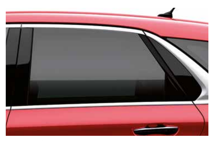
Privacy Glass (from B-pillar backwards) – Standard across the