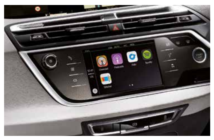
Android Auto & Apple Carplay – Standard across the range