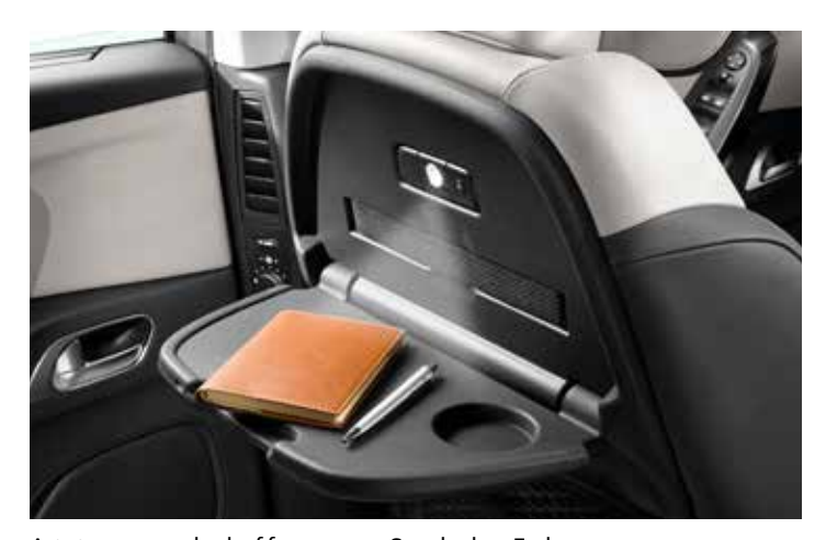
Aviation trays on back of front seats - Standard on Feel