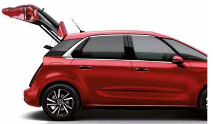
Power tailgate - Standard on Feel Exclusive