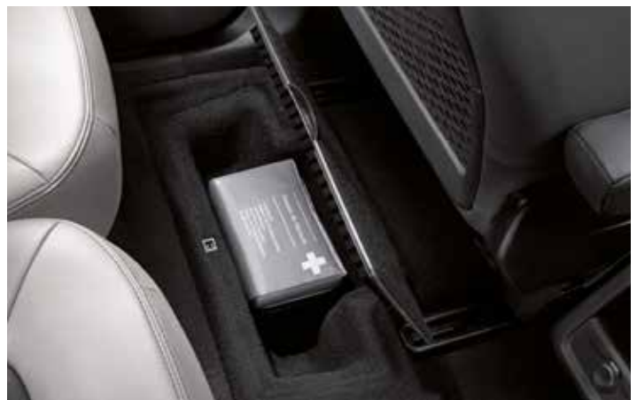
Rear underfloor storage (row 2) – Standard across the range