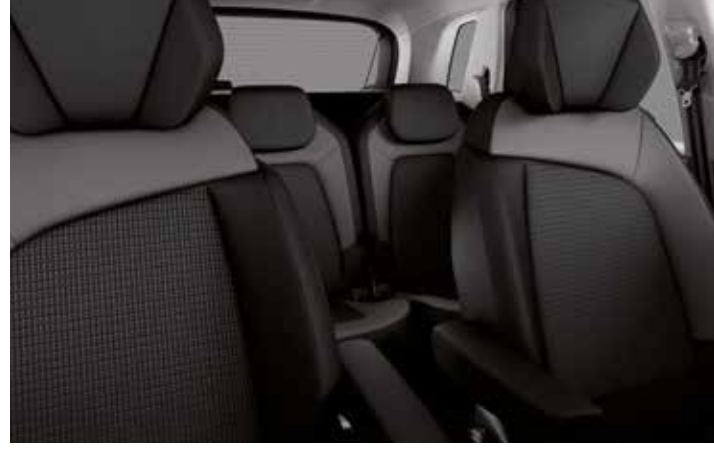
Slate grey half leather with black Ondulice cloth with Hype Grey ambiance – Standard on Feel Exclusive.