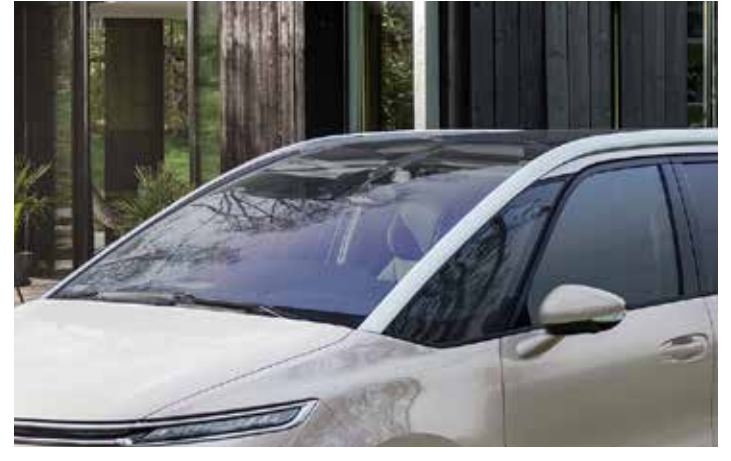
Panoramic windscreen - Standard across the range

We know how important it is to present the right facts and figures, so our brochures are regularly updated, however it is important that you consult your dealer when ordering your vehicle to ensure you are advised of the latest specifications and equipment.