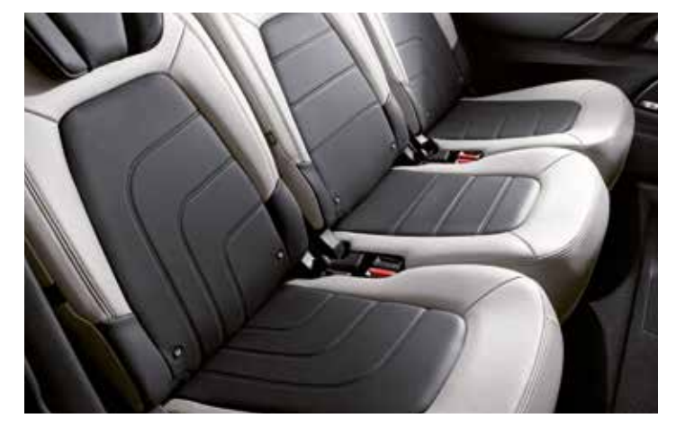
Three ISOFIX mounting points with top tether on all seats in row 2 - Standard across the range