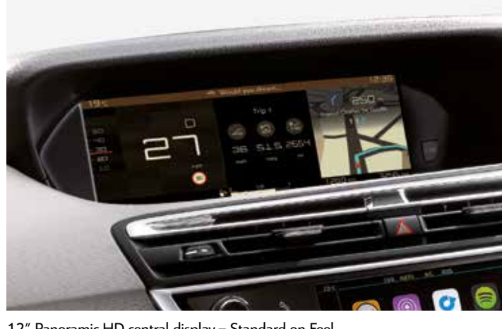
12" Panoramic HD central display – Standard on Feel

SCAN THE QR CODE TO SEE THE HANDS-FREE ACCESS IN ACTION