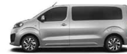
Arctic Steel (M)