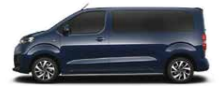
Imperial Blue (F)