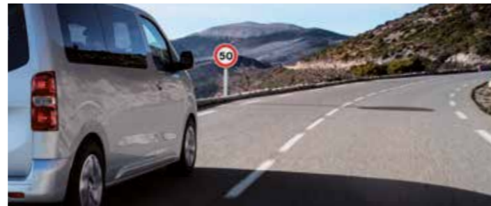
Cruise control with speed limiter – Standard across the range.

Option availability varies according to version/engine/trim level. Some options are only available as part of a pack. Please refer to the options page for further information.