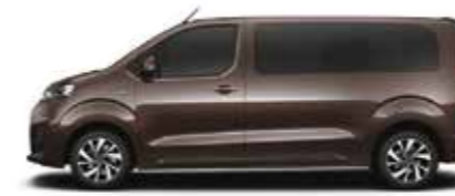
Rich Oak (M)