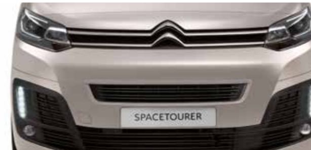
LED Daytime Running Lights – Standard across the range.