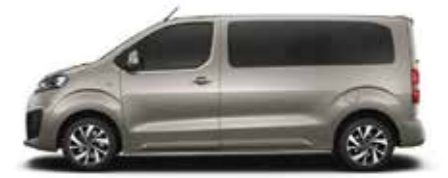
Soft Sand (M)