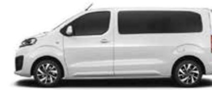
Polar White (F)