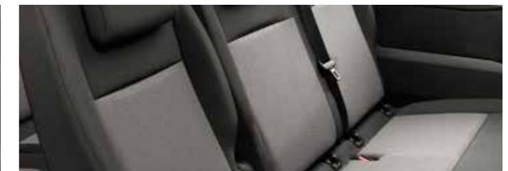
Grey and dark blue 'Yumi' cloth trim Standard on Feel