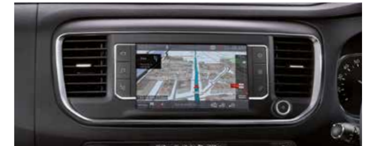
7 inch touchscreen – Standard across the range.