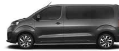
Platinum Grey (M)