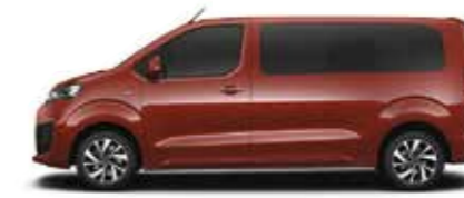
Tourmaline Orange (M)