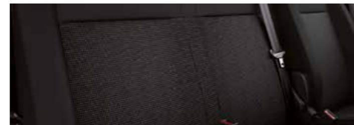
Black 'Mica' cloth trim Standard on Business