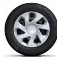
15" Tarkine steel wheels