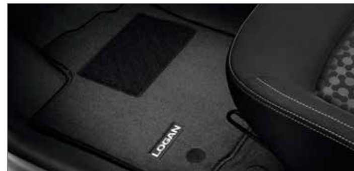
Monitor Mats (Standard)

(1) Genuine leather on central section; synthetic leather on side bolsters and rear.