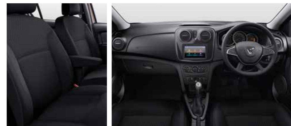
Dark Carbon 'Indite' cloth upholstery with optional armrest