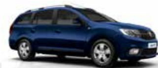
Cosmos Blue (RPR)