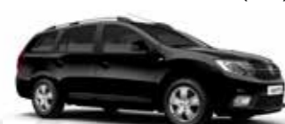
Pearl Black (676)