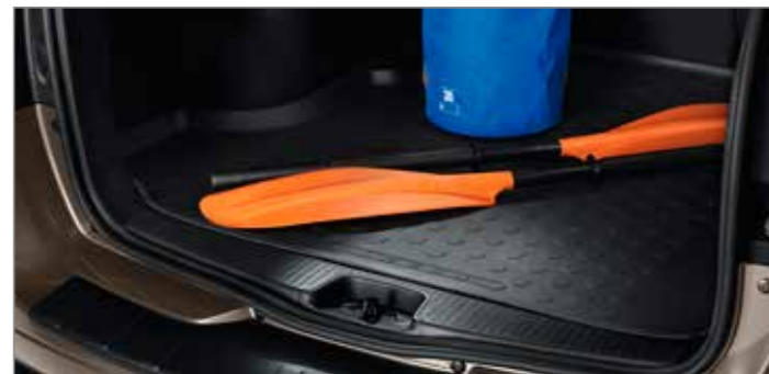
Standard boot liner