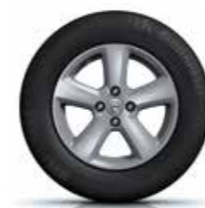
15" Sagano alloy wheels