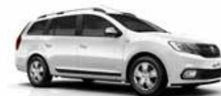
Glacier White (369)