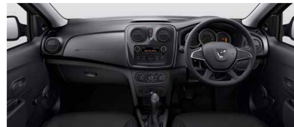
Black 'Cerite' cloth upholstery