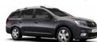
Slate Grey (KNA)