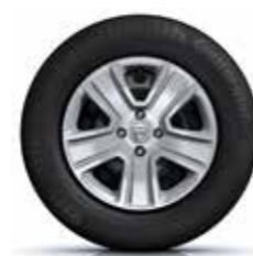
15" Lassen steel wheels