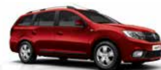
Fire Red (B76)