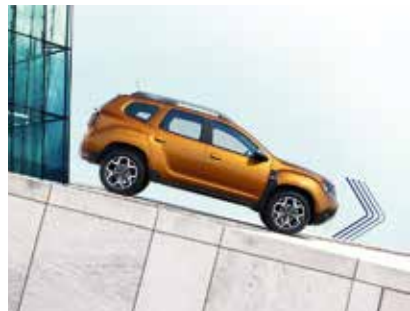
HILL DESCENT CONTROL*