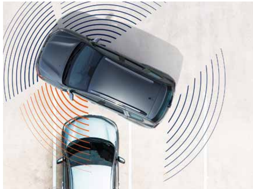
MULTIVIEW CAMERA ^