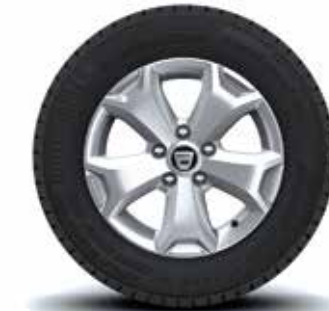
16" 'CYCLADE' ALLOY WHEEL