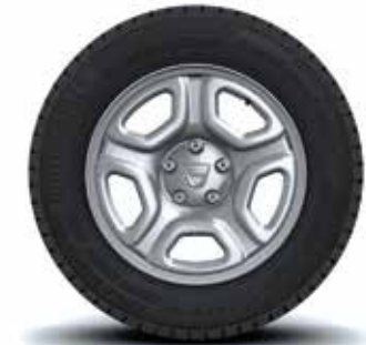
16" 'FIDJI STYLED' WHEEL