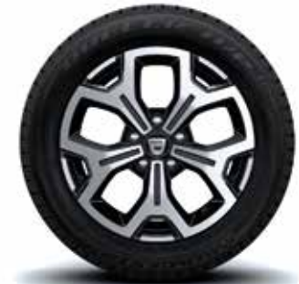
17" 'DIAMOND-CUT' ALLOY WHEEL