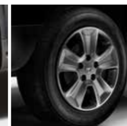
16" 'Tyrol' alloy wheels