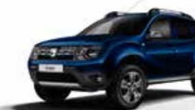
Cosmos Blue (RPR)