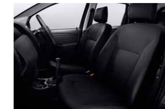
'Bainite' cloth upholstery