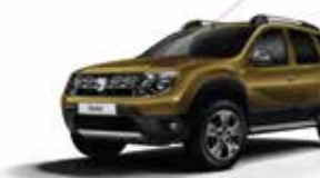
Altai Green (DPC)