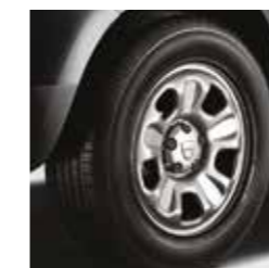
16" 'Matterhorn' steel wheels