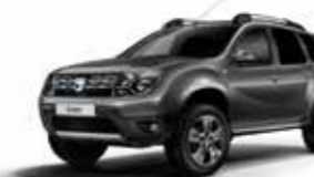
Slate Grey (KNA)