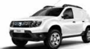
Glacier White (369)