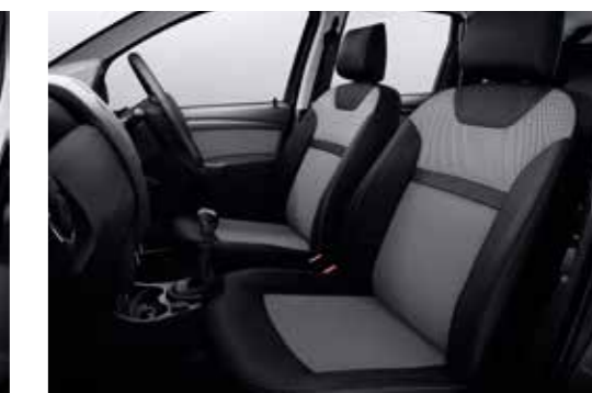
'Graphite' cloth upholstery