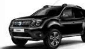
Pearl Black (676)