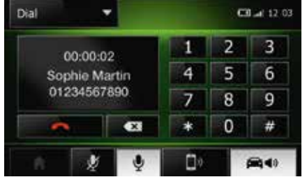
Bluetooth® technology* allows you to make and receive calls on the move.