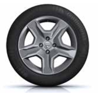
16" 'Stepway' design wheels