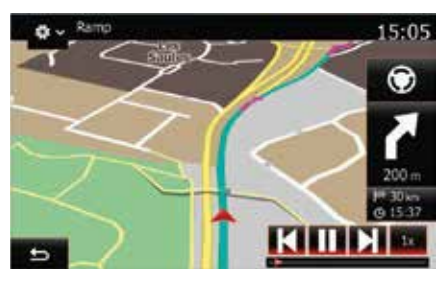
Provided by Navteq with vocal guidance. Listen to DAB, FM or AM radio.