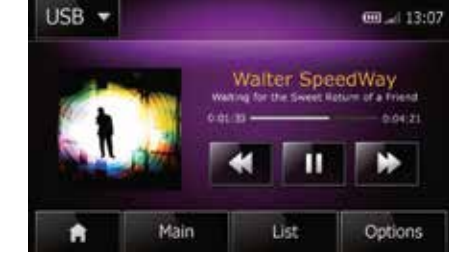
DAB/FM/AM tuner, connect devices via USB and AUX sockets.