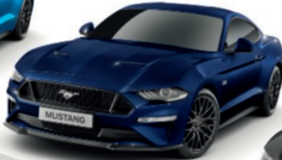
Kona Blue Premium body colour*