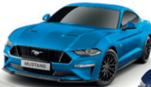
Velocity Blue Premium body colour*