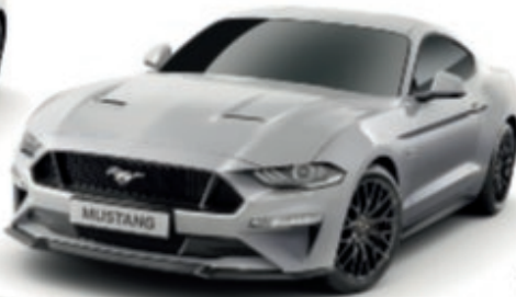
Iconic Silver Premium body colour*