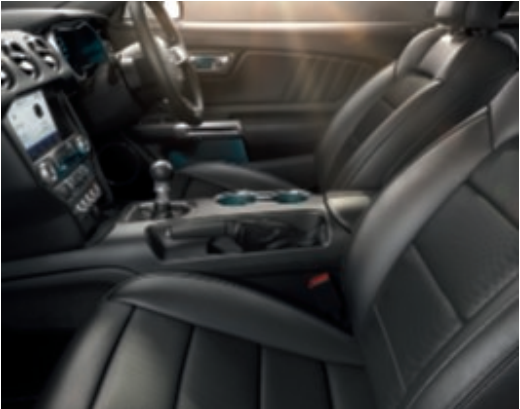
Seat insert Mini Perf over Salerno Leather in Ebony Bolster Salerno Leather in Ebony