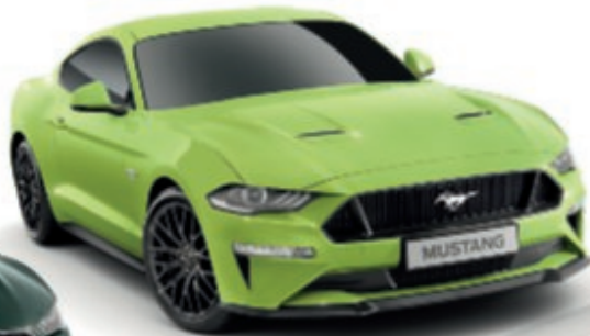
Grabber Lime Exclusive body colour*