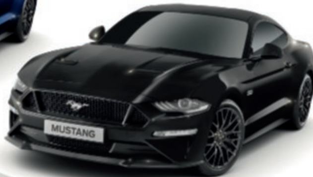
Shadow Black Premium body colour*