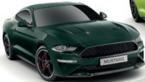
Dark Highland Green o Exclusive body colour*