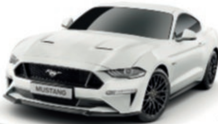
Oxford White Standard body colour