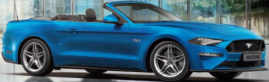
Mustang GT Convertible in Velocity Blue body colour (option) with 19" 5x2-spoke design Luster Nickel painted forged aluminium wheels (option) (GT option available in Custom Packs 3 & 4).