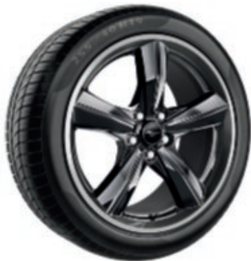
19" x 9" (front) and 19" x 9.5" (rear) 5-spoke "BULLITT" themed alloy wheels in gloss black paint finish

Fitted with 255/40 front and 275/40 rear tyres. (Standard on Mustang55, shown as Black SIP on ford.ie Build & Price)