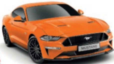
Twister Orange Exclusive body colour*