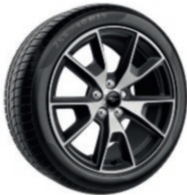
19" x 9" 5 V-spoke design alloy wheels with machined and low-gloss black painted finish

Complement your new Mustang's stunning style with a set of beautifully designed alloy wheels. Offering an ideal combination of strength and light weight, they not only look great, but help to reduce unsprung weight for enhanced ride and handling.