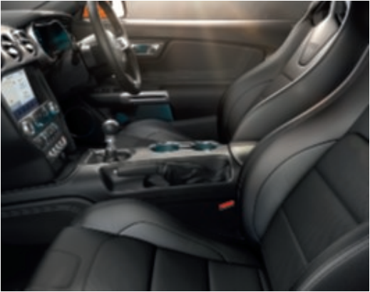
(Recaro) Seat insert Mini Perf over Salerno Leather in Ebony with Metal Grey contrast stitching (Recaro) Bolster Salerno Leather in Ebony