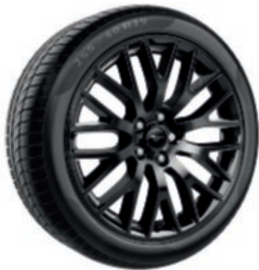
19" x 9" (front) and 19" x 9.5" (rear) 10 Y-spoke design alloy wheels with gloss black painted finish

Fitted with 255/40 front and rear tyres. (Standard on EcoBoost)