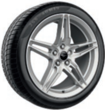
19" x 9" (front) and 19" x 9.5" (rear) 5x2-spoke design Luster Nickel painted forged aluminum wheels

Fitted with 255/40 front and 275/40 rear tyres. (Standard on GT)