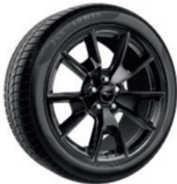
19" x 9" (front) and 19" x 9.5" (rear) 5 V-spoke design alloy wheels in gloss black with machined-face

Fitted with 255/40 front and 275/40 rear tyres. (Option)(GT option available in Custom Packs 3 & 4)