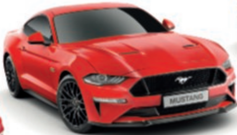
Race Red Premium body colour*