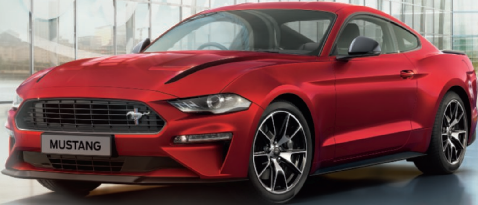
Mustang EcoBoost Fastback in Lucid Red body colour (option) with 19" 5 V-spoke design alloy wheels machined and low-gloss black painted finish.