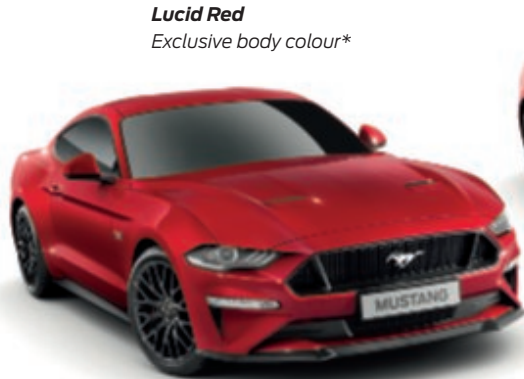
Lucid Red Exclusive body colour*