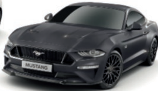
Magnetic Premium body colour*