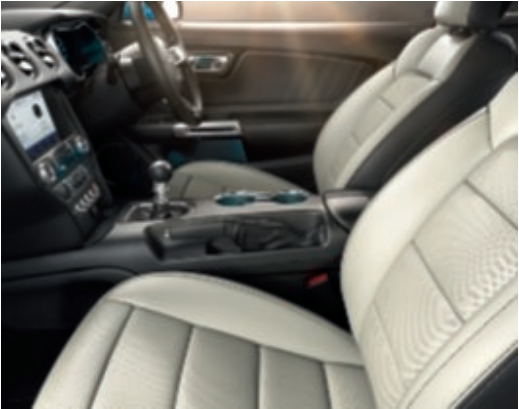
Seat insert Mini Perf over Salerno Leather in Ceramic Bolster Salerno Leather in Ceramic