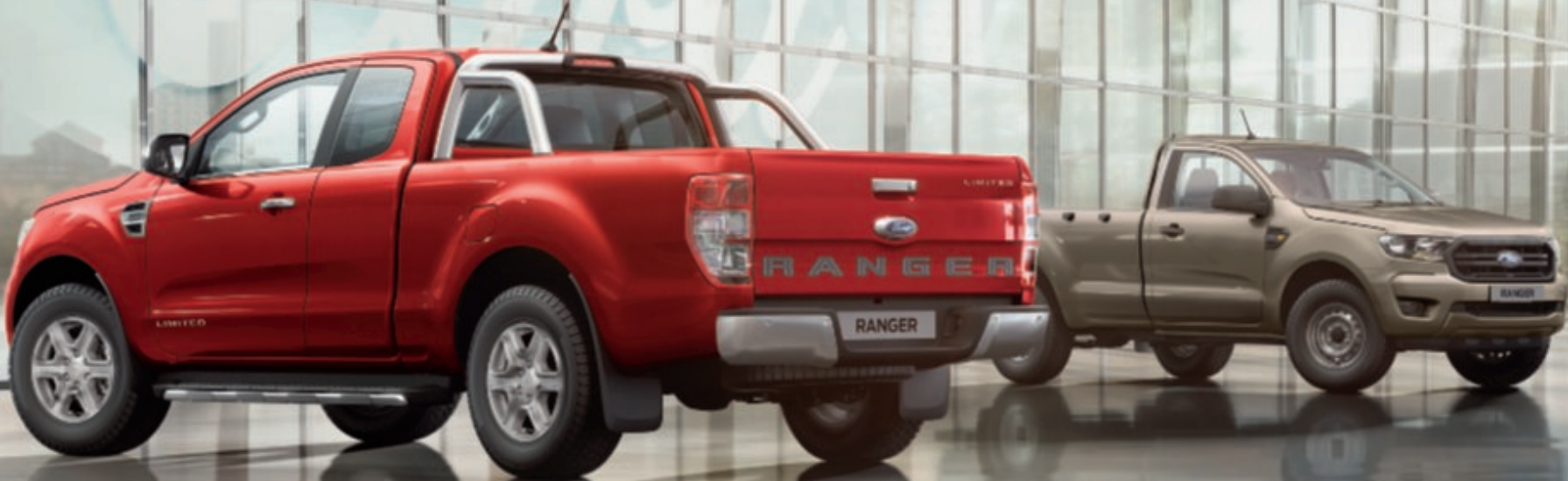
Left: Model shown is a Super Cab Wildtrak in Copper Red metallic body colour (NA in ROI).