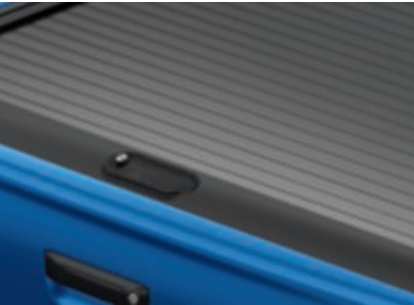
Mountain Top Industries® roller shutter Lockable aluminium roller shutter helps protect your tools or your load.

6-speed manual 10-speed automatic (option)