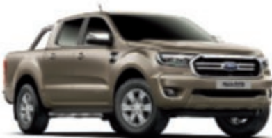
Diffused Silver Metallic body colour*