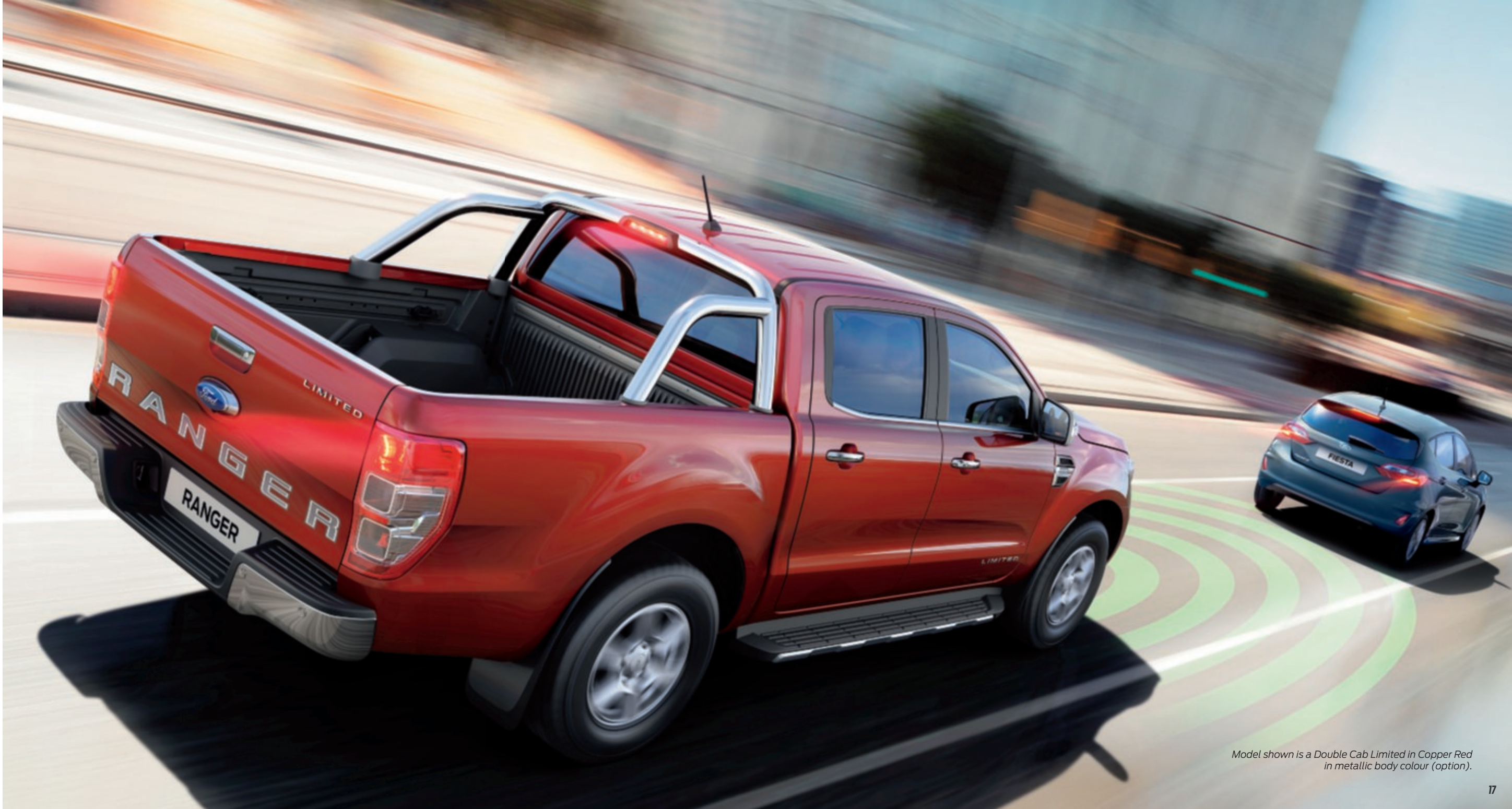
Model shown is a Double Cab Limited in Copper Red in metallic body colour (option).