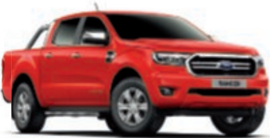
Colorado Red Solid body colour