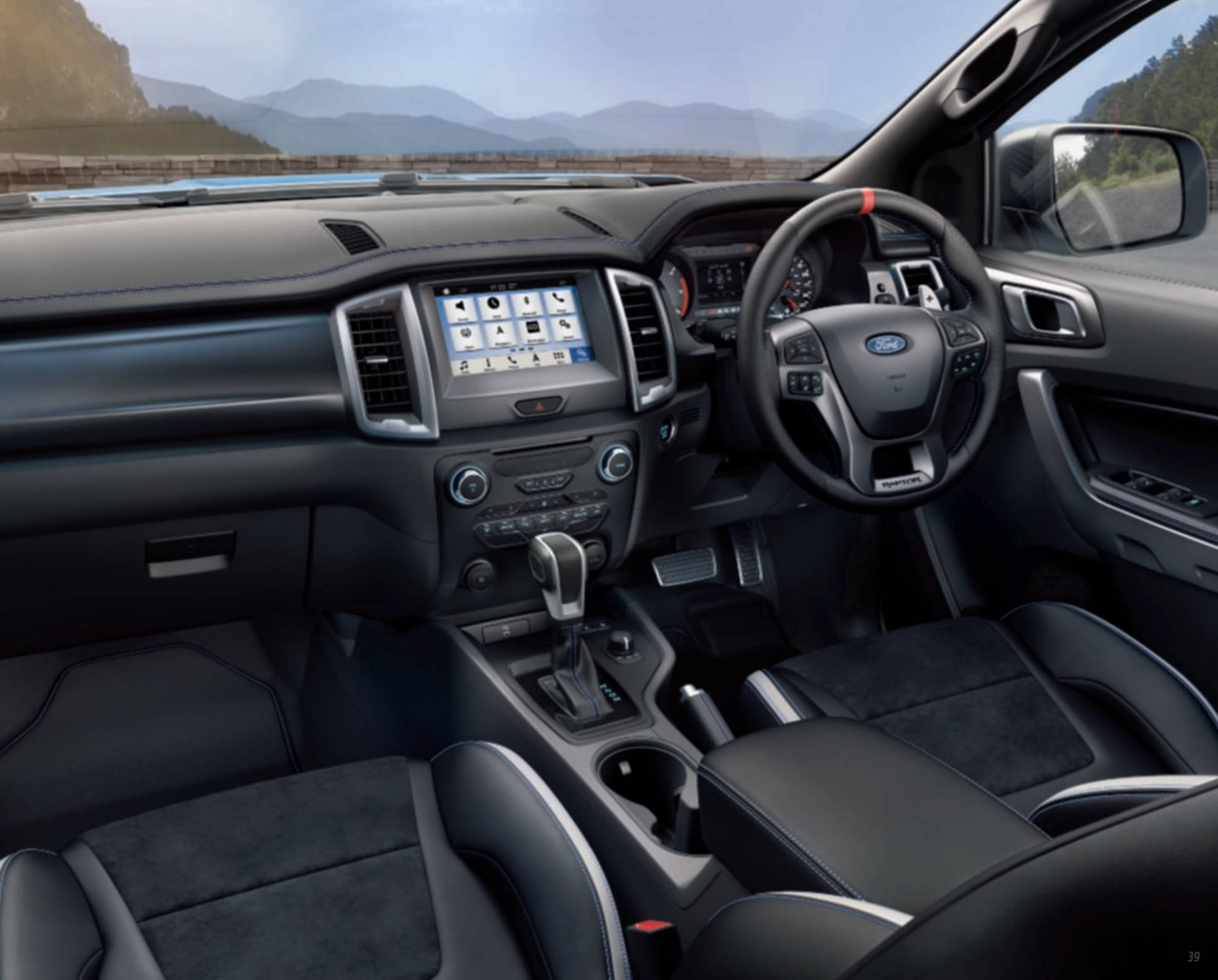
Model shown is a Double Cab Raptor in Ford Performance Blue metallic body colour (option)

Supportive sports seats with unique 'Raptor' logo.