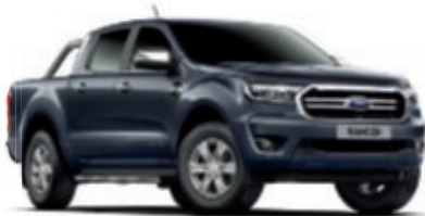
Sea Grey Metallic body colour*