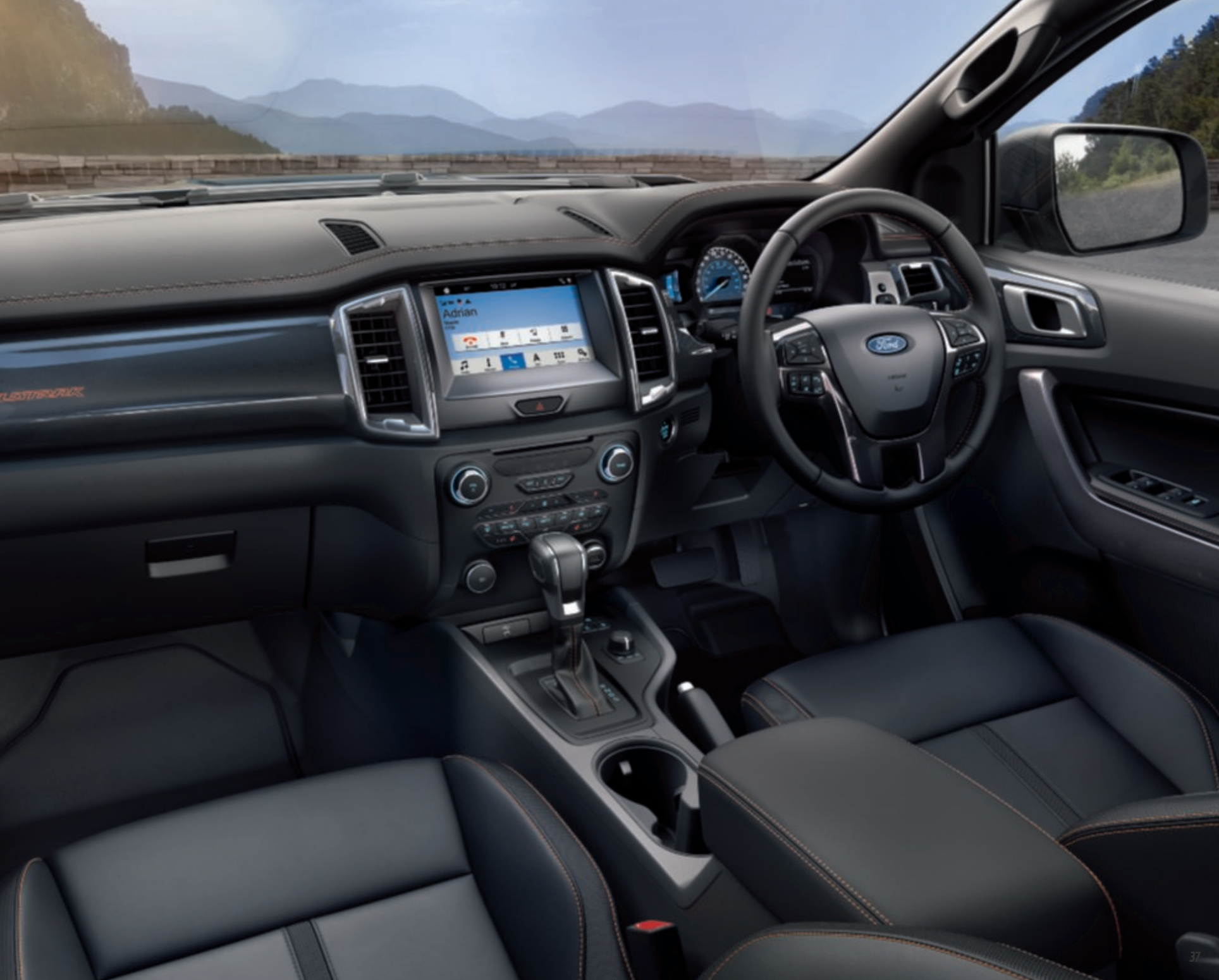
Model shown is a Double Cab Wildtrak in Shadow Black mica body colour.

Listen to, and operate, your memory stick or USB-enabled digital music player via your Ranger's audio system.