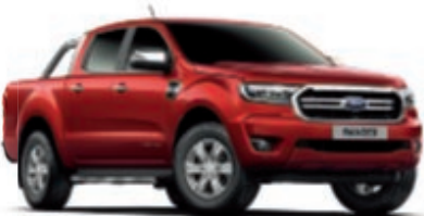
Copper Red Metallic body colour*