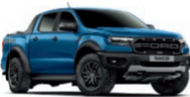
Ford Performance Blue Metallic body colour* (Ranger Raptor only)

12-year perforation warranty The Ford Ranger owes its durable exterior to a thorough multi-stage painting process. From the wax-injected steel body sections to the hard-wearing top coat, new materials and application processes ensure it will retain its good looks for many years to come. Note The images used are to illustrate body colours only and may not reflect the vehicle described. Colours and trims reproduced within this brochure may vary from the actual colours, due to the limitations of the printing processes used. *Metallic and mica body colours are options, at extra cost.