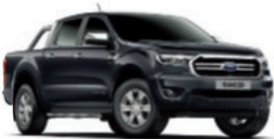
Shadow Black Mica body colour*