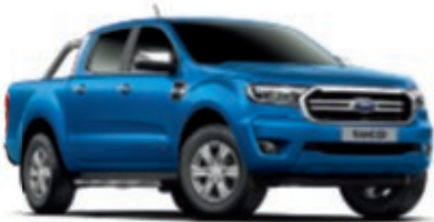
Blue Lightning Metallic body colour*