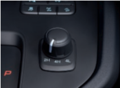
Electronic shift-on-the-fly Change from two-wheel drive to four-wheel drive – and back again – at the flick of a switch when you're on the move.