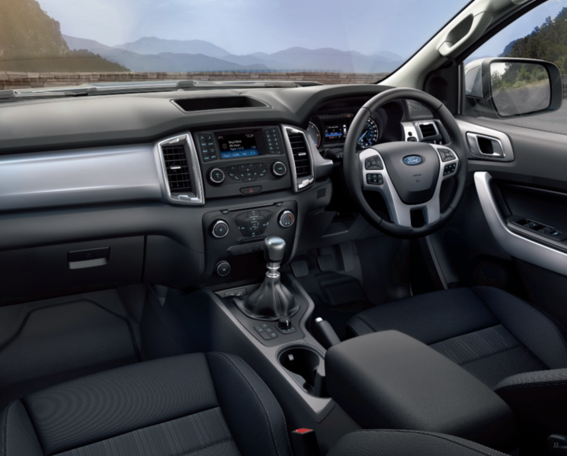
Model shown is a Double Cab XLT in Sea Grey metallic body colour (option).