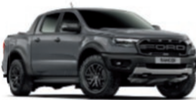
Conquer Grey Solid body colour (Ranger Raptor only)