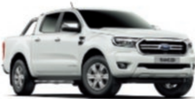
Frozen White Solid body colour