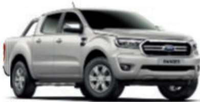
Moondust Silver Metallic body colour*