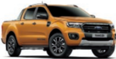
Sabre Orange Metallic body colour* (Wildtrak only)