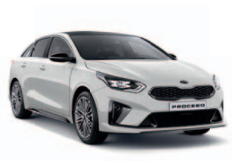
Deluxe White (HW2)