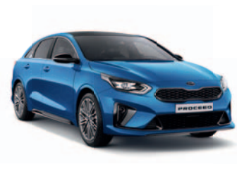
Blue Flame (B3L)