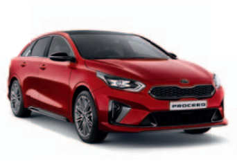
Infra Red (AA9)