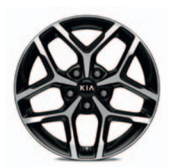
GTL 17" Alloy Wheel