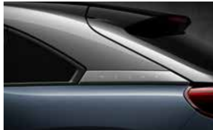
POLYMETAL GREY METALLIC WITH BRILLIANT BLACK ROOF AND SILVER METALLIC SIDE PANELS* ^