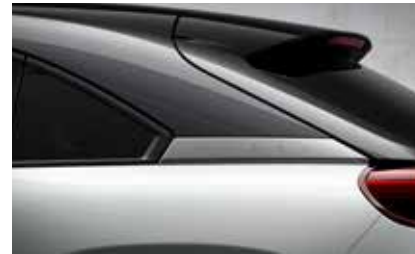
CERAMIC METALLIC WITH BRILLIANT BLACK ROOF AND DARK GREY METALLIC SIDE PANELS* ^