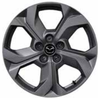
18" Silver Metallic Alloys (Standard on GS-L grade)