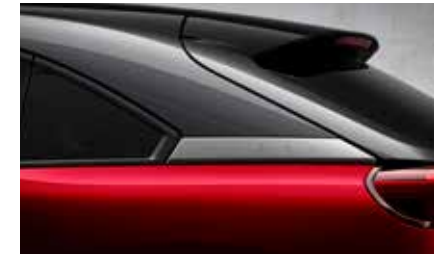
SOUL RED CRYSTAL METALLIC WITH BRILLIANT BLACK ROOF AND DARK GREY METALLIC SIDE PANELS* ^