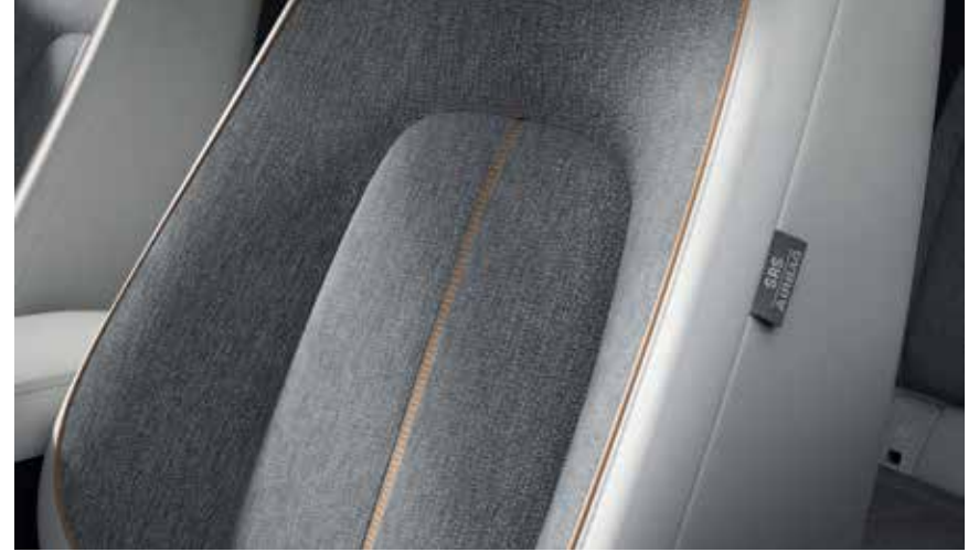
LIGHT GREY CLOTH WITH STONE LEATHERETTE (Standard on First Edition, GT and GT Sport grade)