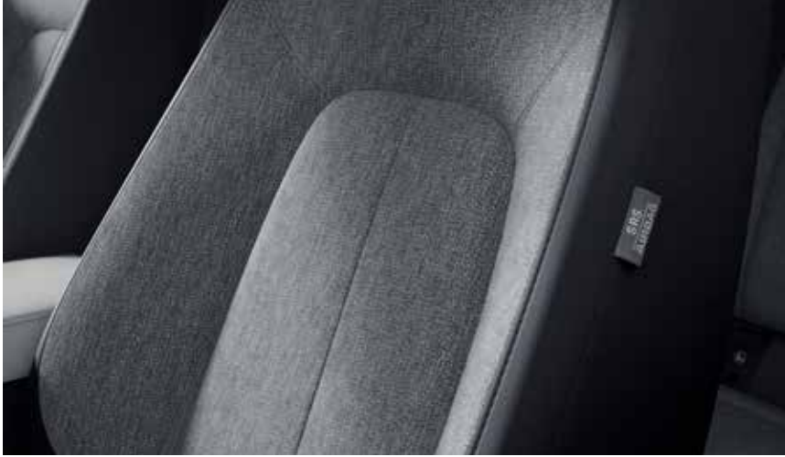
LIGHT GREY CLOTH WITH DARK GREY TRIM (Standard on GS-L grade)