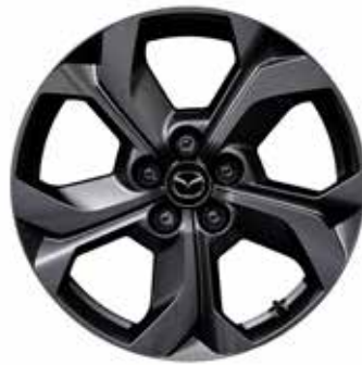
18" Bright Metallic Alloys (Standard on GT, First Edition and GT Sport grades)