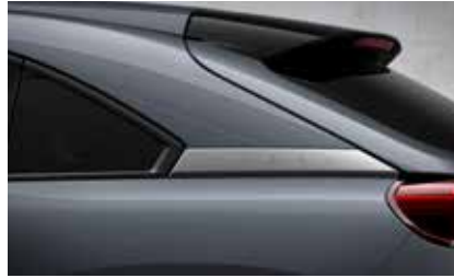
POLYMETAL GREY METALLIC*