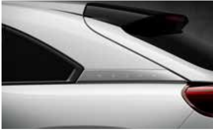
ARCTIC WHITE SOLID