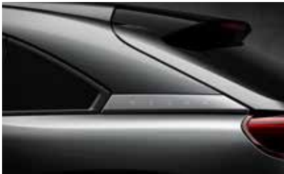
MACHINE GREY METALLIC*