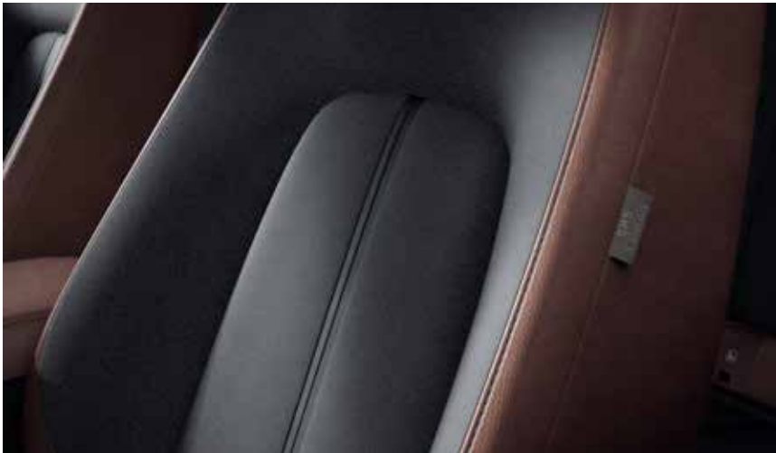
DARK GREY CLOTH WITH BROWN LEATHERETTE (Optional on First Edition and GT Sport grade)