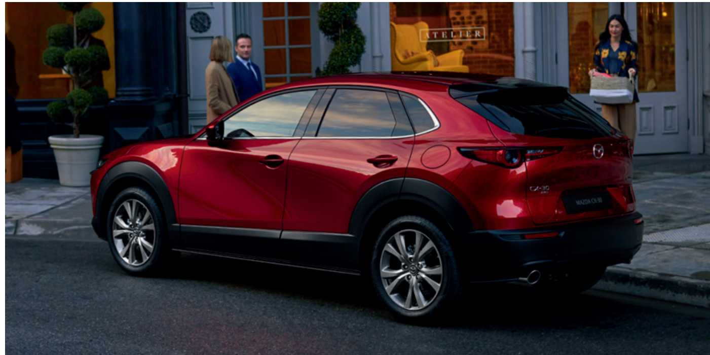
This image is showing All-New CX-30 GT Sport in optional Soul Red Crystal

Using the Japanese concept of 'Ma' – the beauty of space between objects – our Kodo design language also informs the interior space. The human-centric design combines a snug, focused driver's cockpit area with a clean, airy and open cabin space for passengers, that enhances communication between all cabin occupants. Crafted with premium materials, it too achieves a flowing elegance and beauty, together with the bold, can-do attitude of an SUV.