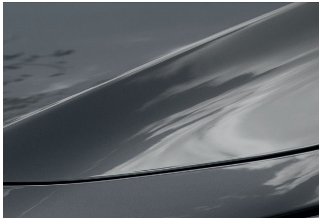
Machine Grey Metallic

Visit our website to see all vibrant colour choices available.