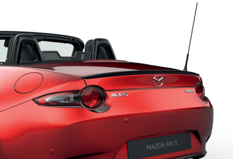
Brilliant Black Boot Lid Spoiler

Mazda has created thoughtfully designed accessories that perform seamlessly with your Mazda MX-5. For a full list of Genuine Mazda Accessories for your Mazda MX-5, visit our website.