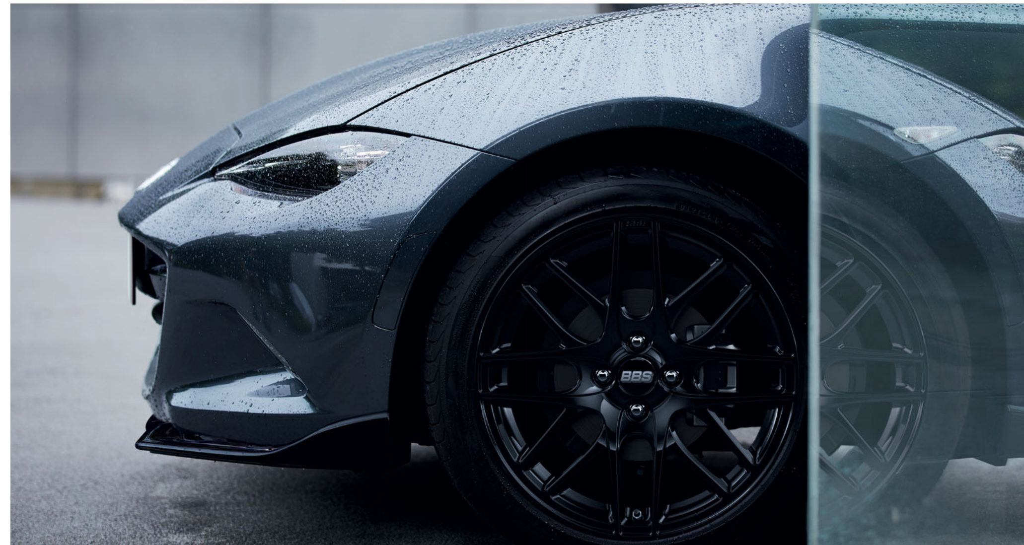
Brilliant black front airdam skirt