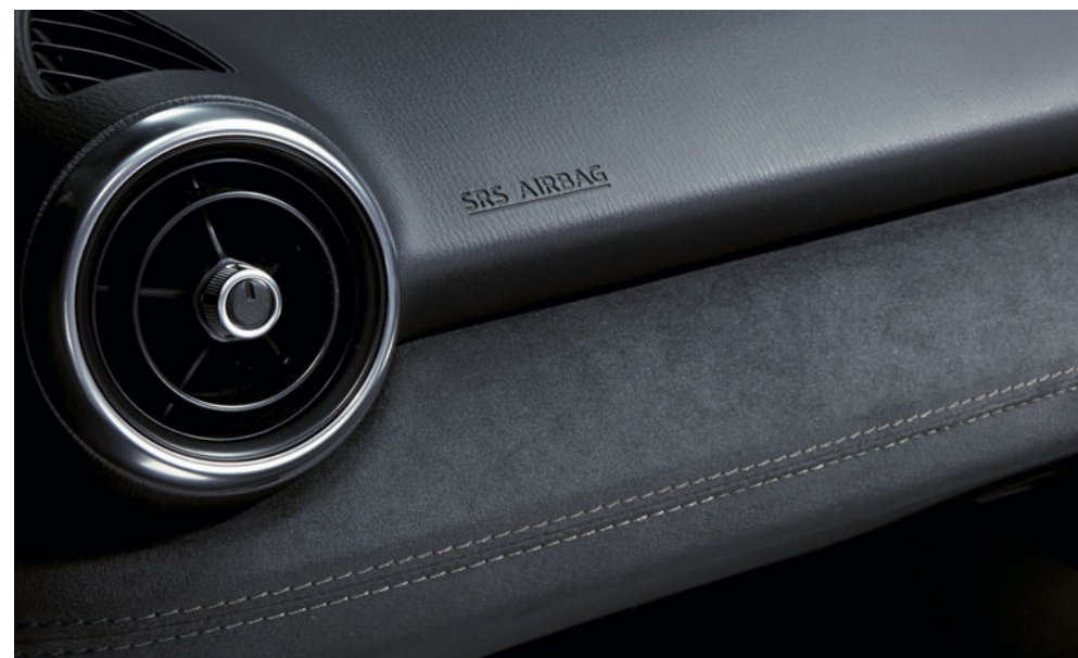
Luxury Alcantara dashboard panel