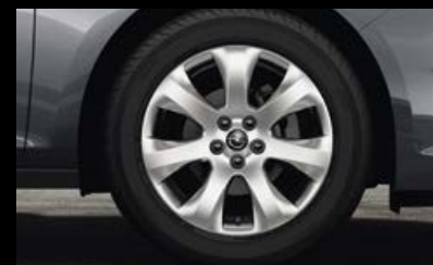
16-inch 7-spoke alloy wheels.

For details of the complete Astra Saloon line-up, please see the Astra Price and Specification guide available to download from www.opel.ie