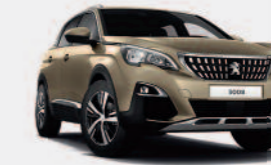
Beige Pyrite (Metallic)