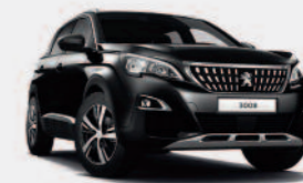
Nera Black (Metallic)