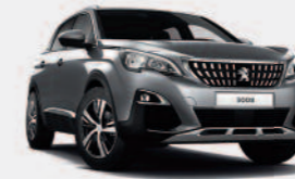
Cumulus Grey (Metallic)