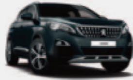
Hurricane Grey (Solid)

*Nimbus Grey (metallic) available on GT Line and GT trims. Please refer to model specification sheet for full details.