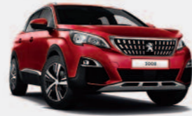
Ultimate Red (Special)