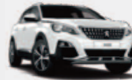
Bianca White (Solid)