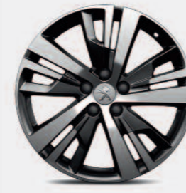
18" 'DETROIT' two-tone diamond-cut alloy wheels