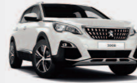
Pearl White (Pearlescent)