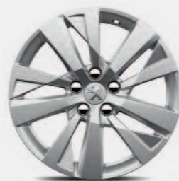
17" 'CHICAGO' alloy

*Optional or standard, according to the trim chosen. Please refer to the model specification sheet for full details.