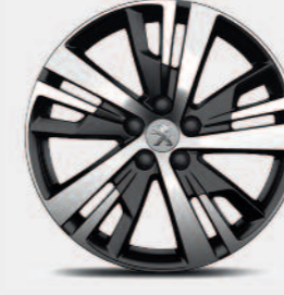
18" 'DETROIT' matt Haria two-tone diamond-cut alloy wheels