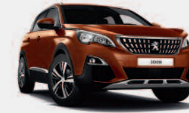
Sunset Copper (Metallic)