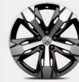
18" 'LOS ANGELES' two-tone diamond-cut alloy wheels (linked to Advanced Grip Control®)