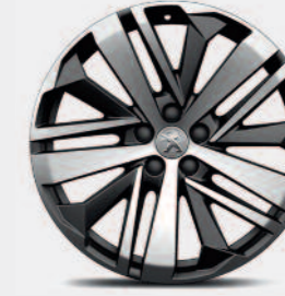
19" 'BOSTON' matt Haria two-tone diamond-cut alloy wheels