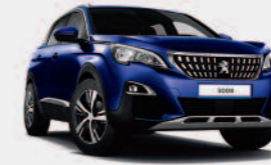
Magnetic Blue (Metallic)