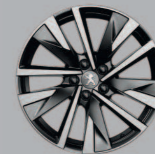
18" SPÉRONE diamond cut two tone