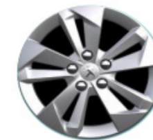
16" 'Taranaki' Alloy wheel