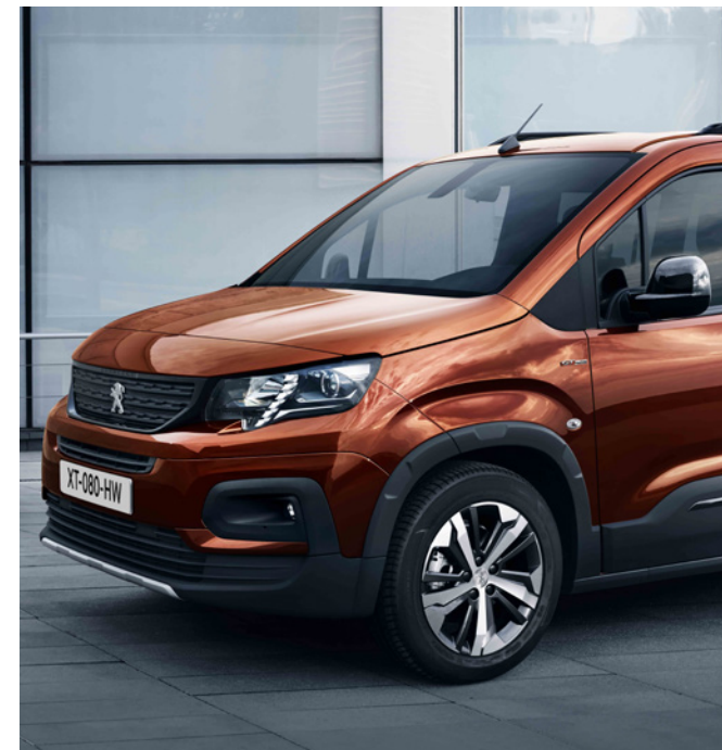
Model shown is new PEUGEOT Rifter GT in Sunset Copper optional special paint