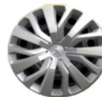
16" Steel Wheel with 'Rakiura' wheel trim