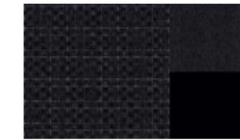
'Casual' cloth seat trim with overstitch detail