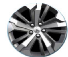
17" 'Aoraki' Alloy wheel