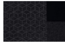
'Enigmatic' cloth seat trim with overstitch detail