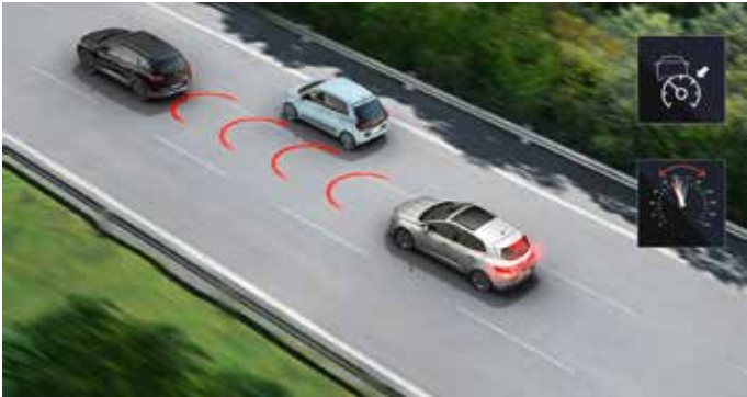
Adaptive cruise control Easily maintain the appropriate safe following distance between you and the vehicle in front. In order to adapt your speed, the adaptive cruise control is activated at between 50 km/h and 140 km/h. The system acts on the brakes when the distance is too short and on the accelerator when the road is clear again.