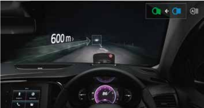
Auto high/low beam: High beam automatically switches to low beam when the front camera detects other vehicles around and automatically switches back to high beam when nothing is detected around.