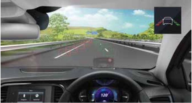
Lane departure warning: This system detects the lane in front of the vehicle with a camera and warns the driver audibly if they drift into another lane .