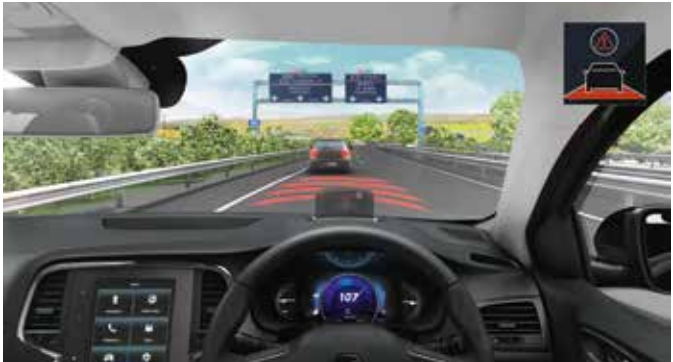
Safe distance warning: This system warns the driver about potential collision with another vehicle in front, if the distance between the vehicles is not safe.