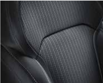
Charcoal cloth upholstery