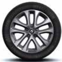
SEBRING - 17" alloys wheels