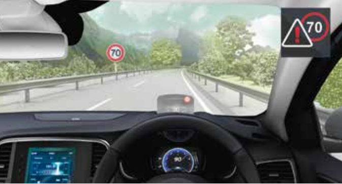
Traffic sign recognition There are more and more road signs. It's not easy to catch every sign; let the camera handle it for you. If you exceed the authorised speed limit, a warning appears on the dashboard. All you have to do is adapt your driving.

Drive with peace of mind! All-New Renault Mégane is available with several driving assistance systems. Using intuitive and intelligent technologies, they support you on all your journeys, guaranteeing your day-to-day peace of mind.