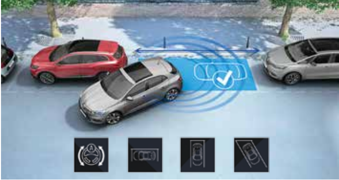
Hands free parking Parallel parking with a flick of the wrist! Hands free parking helps you to identify the parking space configuration (parallel, diagonal or perpendicular), measures the available space and handles the manoeuvre. All you have to do is control the accelerator, brakes and gears. A genuine co-pilot by your side!