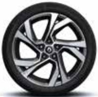
DAYTONA - 18" diamond cut alloy wheels