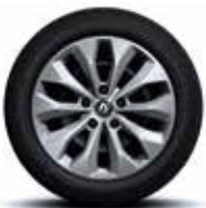
16" steel wheels with wheel trims