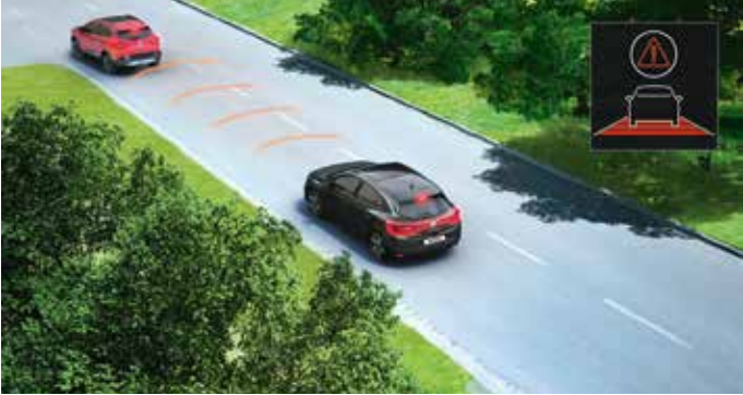
Active emergency braking system: This system alerts the driver if there is a risk of collision with the vehicle in front. If the driver reacts insufficiently or not at all, the brakes are activated to prevent or mitigate a collision.