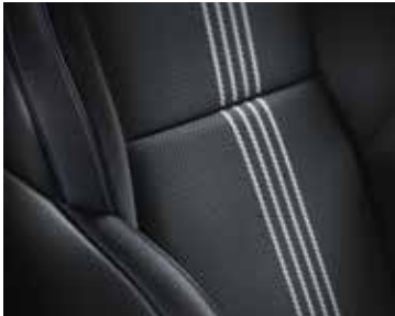
Black cloth upholstery