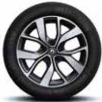
FLORIDA - 17" diamond cut alloy wheels