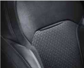
Black synthetic leather and cloth upholstery