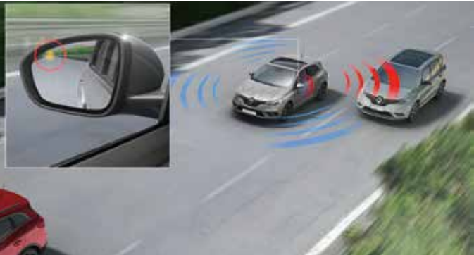
Blind spot warning Expand your vision! New Renault Mégane is equipped with a system which detects the presence of any vehicle in the zone that your rearview mirrors do not allow you to see. Active between 30 km/h and 140 km/h, the system alerts you straight away with a warning light.