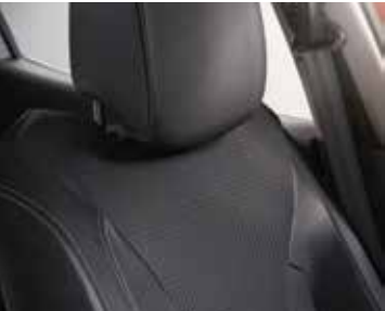
Dark carbon cloth with mesh inserts and grey piping