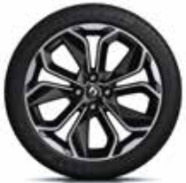
17" black alloy wheel