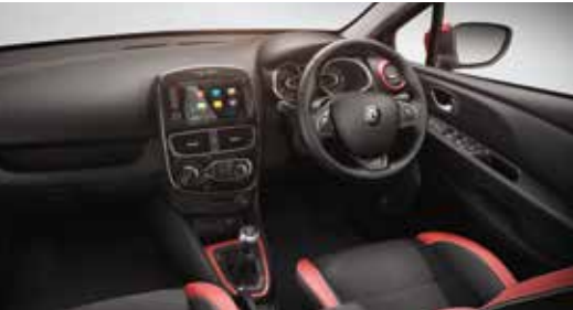
Interior Touch Pack in red