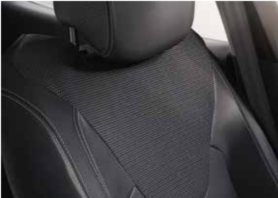
DARK CARBON CLOTH UPHOLSTERY WITH MESH INSERTS AND GREY PIPING