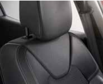
Black cloth upholstery with synthetic leather headrest and sides