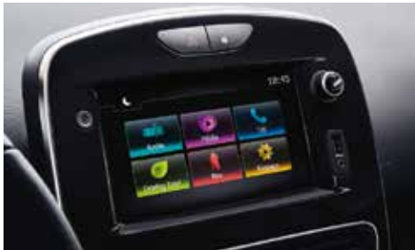
Main menu with 6 icons Radio, Multimedia, Telephone, Eco Driving, Navigation, System settings.

Renault's on-board touch screen tablet MediaNav (standard on Dynamique Nav and Dynamique S Nav) provides access to useful and practical features including: navigation, media from multiple sources, hands free telephone using Bluetooth®* technology and Eco driving giving you advice to reduce your daily fuel consumption. Enjoy stress free travel with Renault MediaNav.