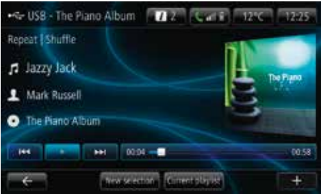
Multimedia FM/AM/DAB tuner, connect devices via USB and AUX sockets or Bluetooth®*.