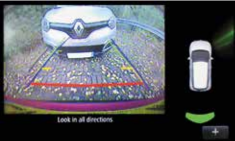
Reverse parking camera system Front and rear parking sensors with reverse parking camera, which displays the image on the navigation system screen alongside guidance aids.