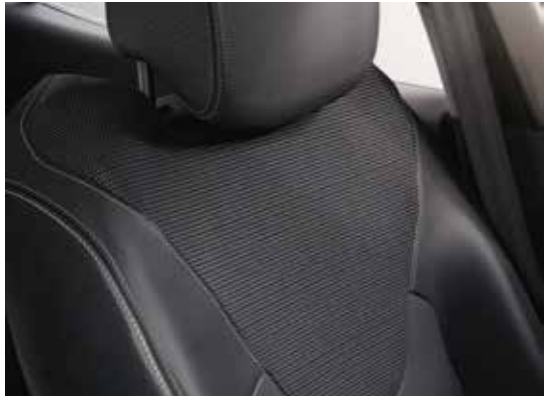
DARK CARBON CLOTH UPHOLSTERY WITH MESH INSERTS