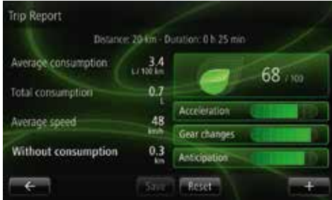
Vehicle information The fun "Eco Driving" coach gives you handy tips to improve your driving style and reduce your fuel consumption.