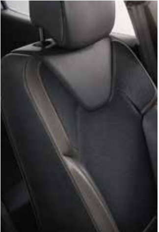
Black velvet upholstery with synthetic leather headrest, sides and grey piping