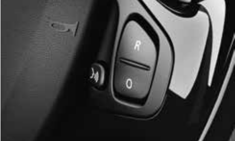
Voice control Set your destination, call a contact or launch an application with voice control*.