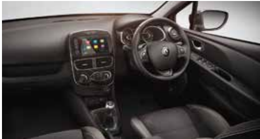
Interior Touch Pack in graded grey