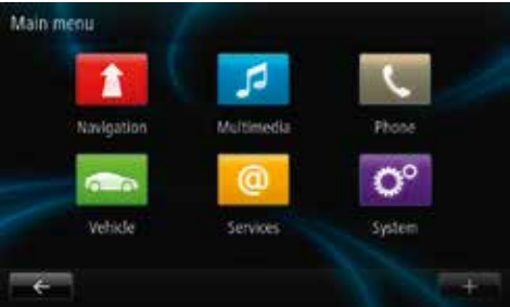
Main menu with 6 icons Discover the six available menus: navigation, multimedia, telephone, vehicle information, services and applications, system settings.

R-Link is available with the Techno Pack which also includes front and rear parking sensors and a reverse parking camera (optional on Dynamique S Nav).