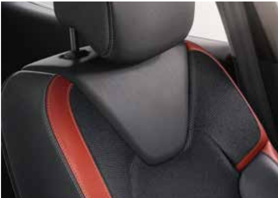
BLACK VELVET UPHOLSTERY WITH SYNTHETIC LEATHER HEADREST AND SIDES AND RED PIPING