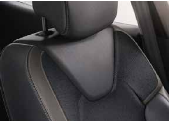
BLACK VELVET UPHOLSTERY WITH SYNTHETIC LEATHER HEADREST AND SIDES AND GREY PIPING

Dark Carbon Cloth Upholstery with Mesh Inserts