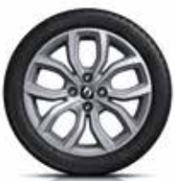
16" alloy wheel