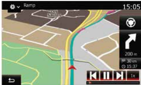
Navigation Provided by Navteq with vocal guidance.