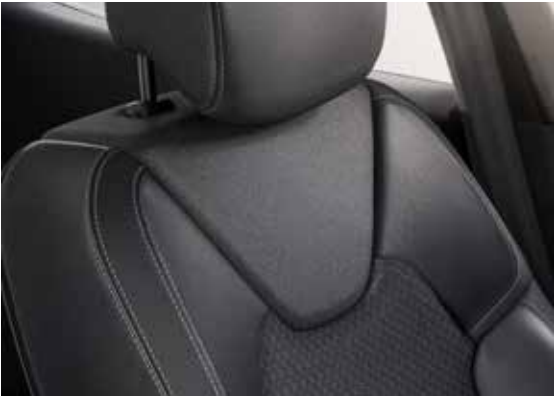
BLACK CLOTH UPHOLSTERY WITH SYNTHETIC LEATHER HEADREST AND SIDES