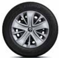
15" Lagoon wheel trims