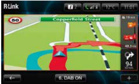
Touchscreen navigation system Provided by TomTom® (12 months subscription to LIVE services from delivery).