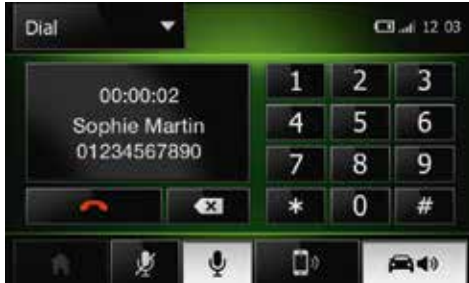
Phone Bluetooth® technology* allows you to make and receive calls on the move.