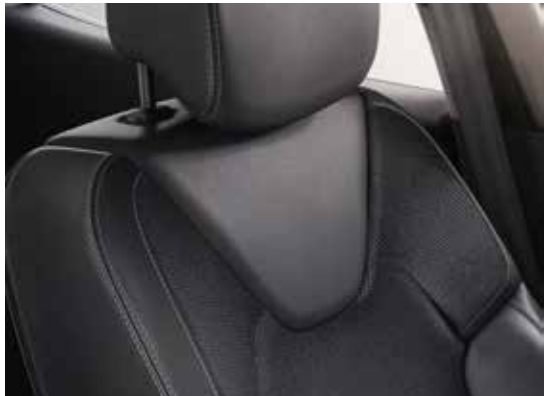
BLACK VELVET UPHOLSTERY WITH SYNTHETIC LEATHER HEADREST AND SIDES