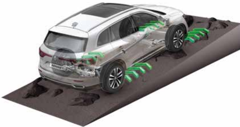
4WD / LOCK

4WD/Lock mode Lock All-New Renault Koleos in 4WD when driving on unsealed roads, slippery roads, snowy roads, off roads or steep hills.