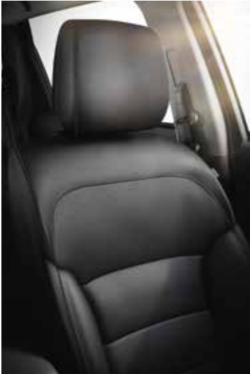
Carbon Black leather upholstery†