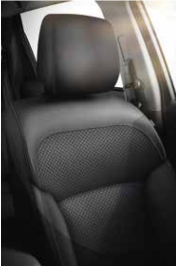
Synthetic leather and cloth upholstery