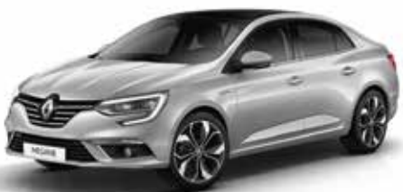
PLATINUM (2) D69