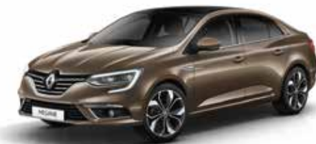
MINK (2) CNM