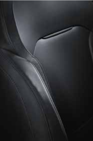
Black leather upholstery