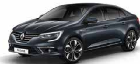
TITANIUM GREY (2) KPN