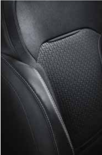
Carbon Black synthetic leather and cloth upholstery