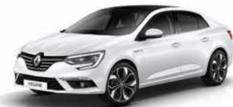
GLACIER WHITE (1) 369