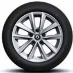
DAKOTA - 16" alloy wheels