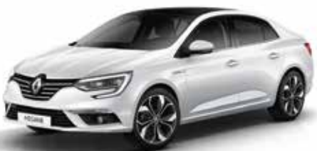
PEARL WHITE (3) QNC