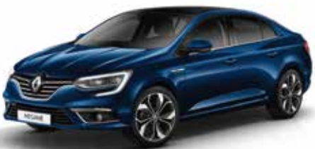
COSMOS BLUE (2) RPR