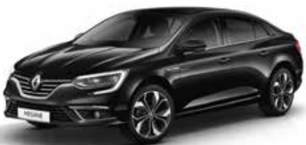
PEARL BLACK (2) GNE