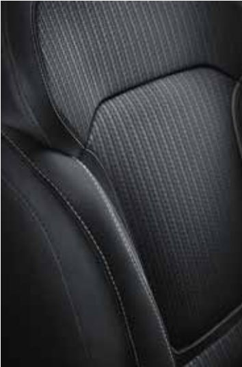
Carbon Black cloth upholstery