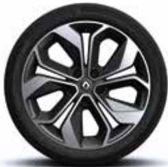
CALIFORNIA - 18" diamond cut alloy wheels