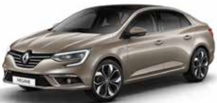
DUNE BEIGE (2) HNP

(1) Non metallic paint (2) Metallic paint (3) Renault i.d. metallic paint