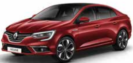
MARS RED (3) NPK