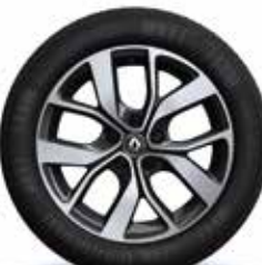
FLORIDA - 17" diamond cut alloy wheels