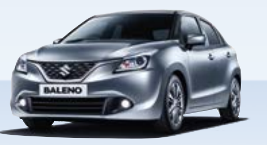
Premium Silver Metallic