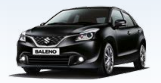
Midnight Black Pearl Metallic