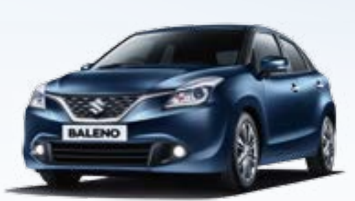
Ray Blue Metallic