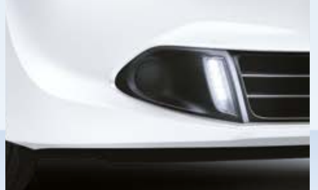
LED daytime running lights