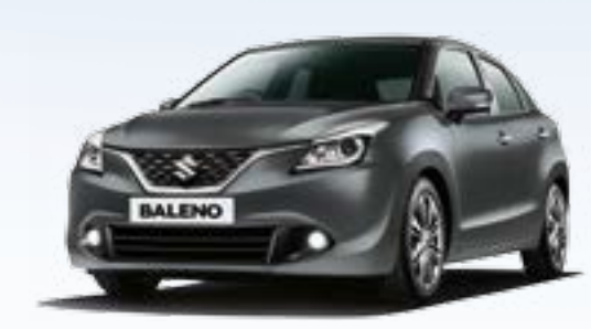
Glistening Grey Metallic